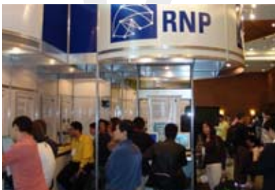
RNP's stand at the 7 th WRNP