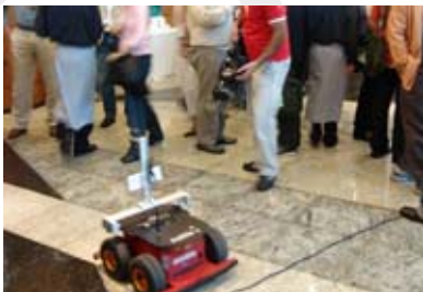
Presentation of the Remote Visualization Working Group during the 7 th WRNP